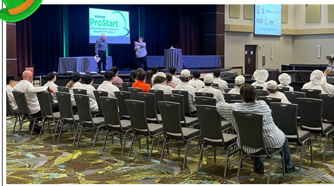
ProStart Competition - 2024