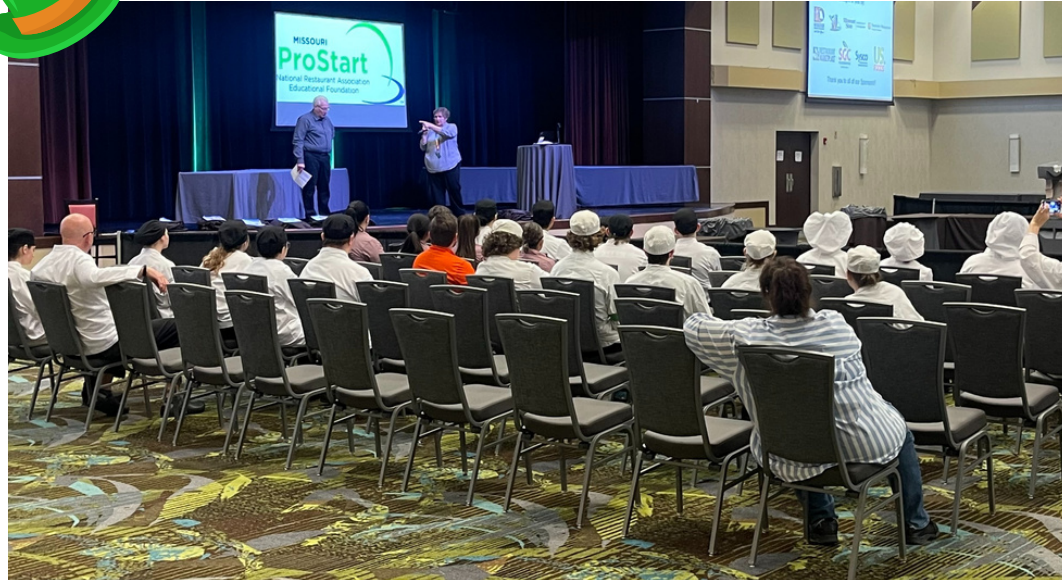
ProStart Competition - 2024

To register for an event visit our website!