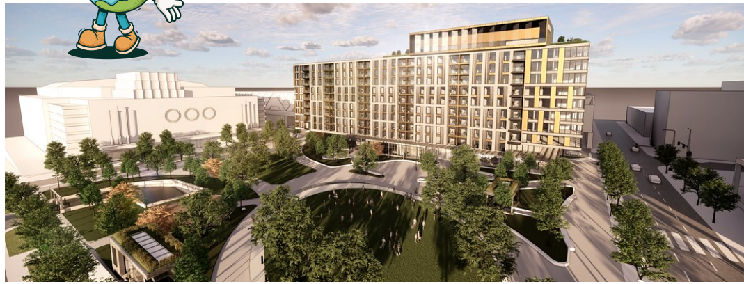
Tentive Designs for Barney Alis Plaza Redevelopment