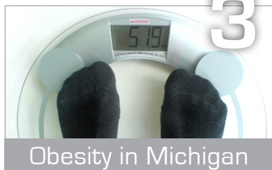
Obesity in Michigan