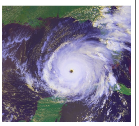
Hurricane Rita (2005) near peak strength in the Gulf of Mexico

What is a hurricane? When do tropical storms and hurricanes occur? How do we measure hurricane strength? How do I stay safe in a hurricane?