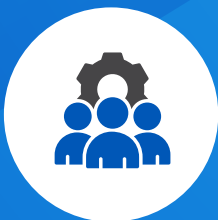
Regular Utility Members

Check out what your membership dues deliver—right now—with no hidden fees.