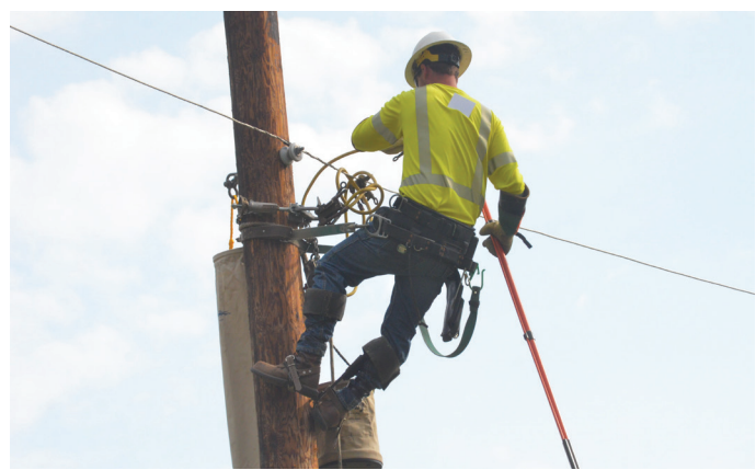
Event 3: Arrester Change Out

Mean time: 6 minutes Drop dead time: 9 minutes