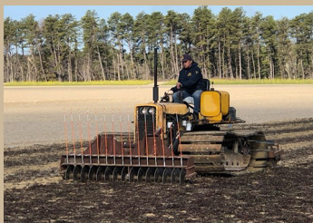
BOG CONSTRUCTION AND RENOVATION MATERIALS