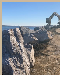
BOULDERS, STONE AND ROCK SUPPLIES