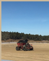
BOG MAINTENANCE MATERIALS