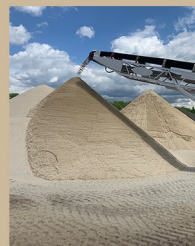
SCREENED AND BANK SAND

CONSTRUCTION MATERIALS • BIORETENTION SOILS • TOPDRESSING SAND ATHLETIC FIELDS • STABILIZED STONEDUST • PLANTING BED SOILS • GREEN ROOF MEDIA