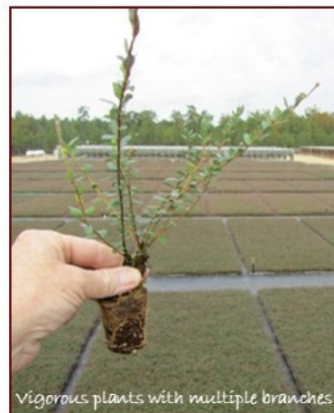
Vigorous plants with multiple branches

Providing 100% 'DNA Fingerprinted', 'Virus Tested' and 'Phytoplasm Tested' Plant Material