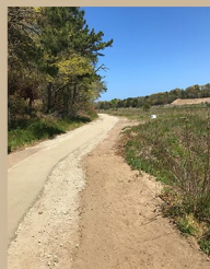
STABILIZED STONEDUST® FOR NATURAL ADA TRAILS