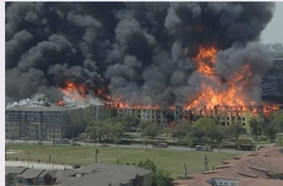
2014 Montrose Apartment Fire – Houston, TX Welding on roof – windy, no extinguishers Destroyed $50M luxury apt. complex

Hot work involves any task capable of igniting a fire or explosion – think welding, torching, burning, grinding/sawing that produces sparks, arc/plasma cutting, flame soldering, torch-applied roofing, & similar work.