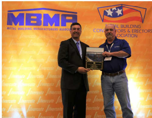
Paramount Metal Systems received the Award of Merit for Beyond Self Storage