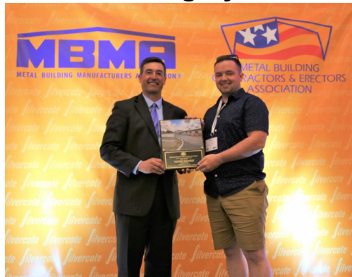
Quality Erectors and Construction Co. received the Award of Excellence for Solano County SB1022 Classroom and Vocational Training Center