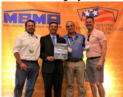
Thomas Phoenix Intl. received the Award of Excellence for Four Winds Plaza Reroof