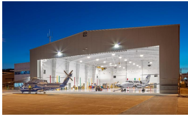
2019 Building of the Year