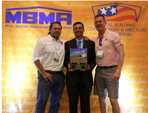
Thomas Phoenix Intl. received the Award of Excellence for RLS Freezer Building