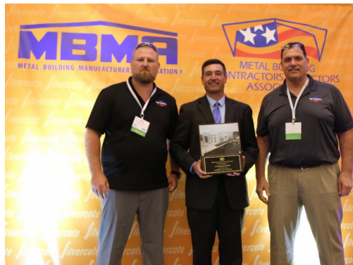
Steel Worx Solutions received the Award of Merit for Harbor Isle Marina