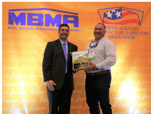
Steel Worx Solutions received the Award of Merit for Atlanta Braves Spring Training Clubhouse Facility