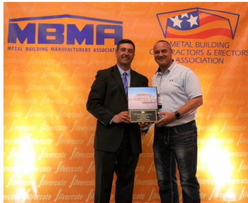
Crossland Construction Company received the Award of Excellence for The Tulsa Expo Center