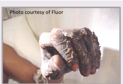
"This worker had oil on his left hand while adjusting pressure at oxygen regulator, where there was a leak."

· Oxygen is a strong oxidizer. By itself, it doesn't burn but it makes other things burn hotter, faster, & easier. Materials that do not burn easily in normal air can burn readily in the presence of pure oxygen.