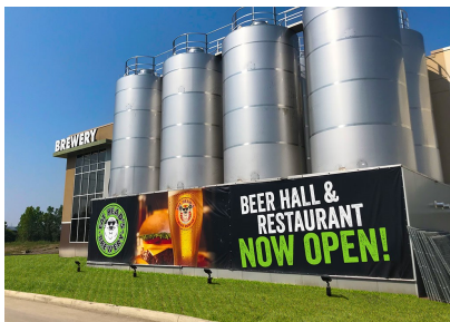
Fat Head's Brewery.

Register Now for our 3rd Annual Holiday Banquet! Thursday, January 9, 2020 5-9 pm