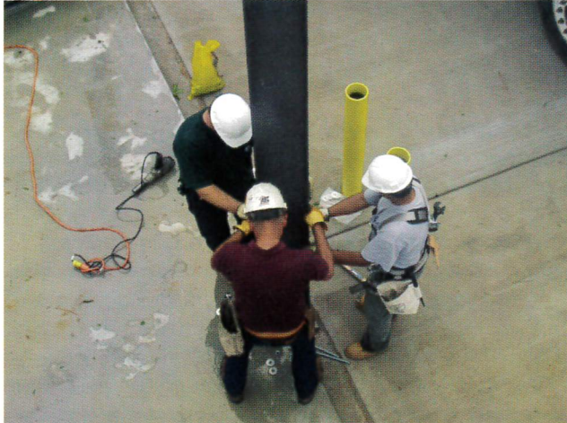
Men at work!