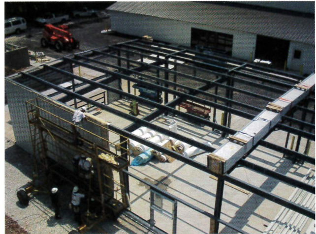
The building begins to take shape!