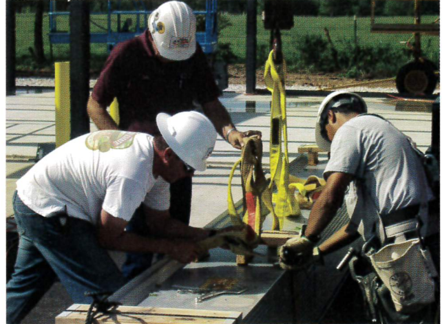
Demonstrating the proper and safe way to erect a metal building.