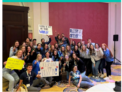
MAPA - STUDENT CHALLENGE BOWL