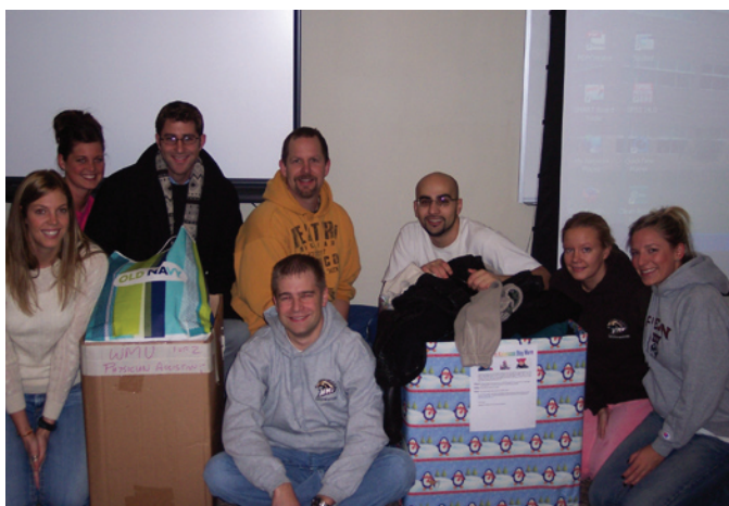
Members of the WMU SAAAPA Chapter with some of the items collected during the winter coat drive.

Our class is also participating in the American Cancer Society's Relay for Life in April. The 24 hour event will be held beginning on April 11th at Kanley Track on the campus of Western Michigan University. To donate to the ACS Relay for Life direct your web browser to www.relayforlife.org locate the WMU relay and search for 'PA Powerhouse'