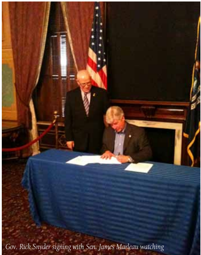
Gov. Rick Snyder signing with Sen. James Marleau watching

This law significantly impacts both physicians and PAs and legally removes the barriers that have impeded the efficiency and effectiveness of the physician/PA team. The result is increased patient access to care, increased patient satisfaction and improved safety. All aspects of the law have been given immediate effect except for full schedule II prescriptive authority. The State of Michigan has to notify the DEA of the change in the law. The DEA must process the request through their computer system and PAs will have to submit an updated Physician Delegation Form and DEA Registration Form requesting a change, if you do not already have schedule 2 and 2N authority.