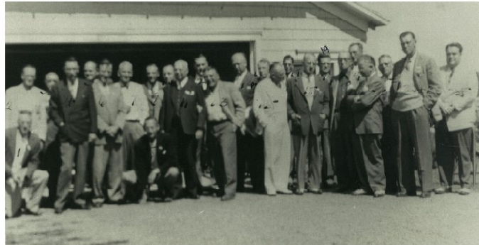
The 1949 attendees outside the Pearsons' garage.