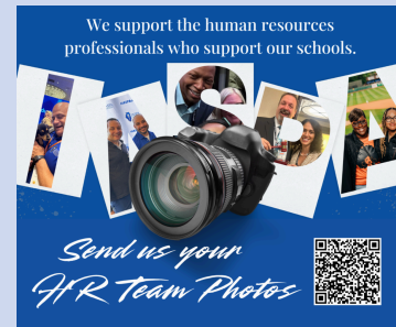
Photo Submission Here