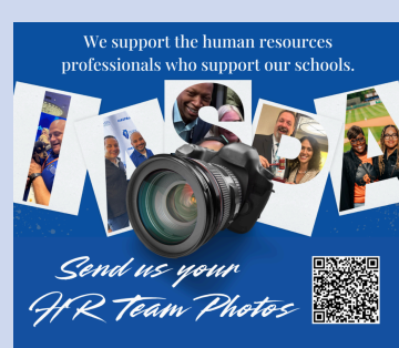
Photo Submission Here