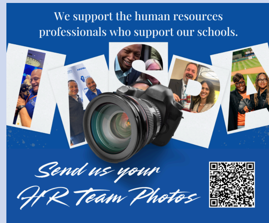
Photo Submission Here