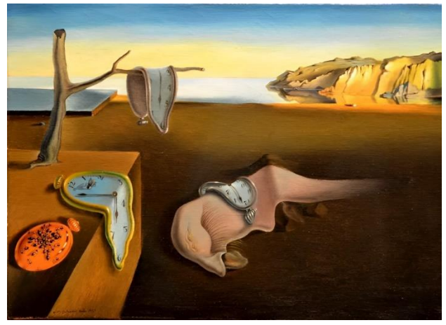
La persistencia de la memoria (Salvador Dali, 1931).

Indeed, even if 'irreversibility of time' is accepted as an axiom in theories on human development, this claim may be insufficient or inaccurate, depending on the system and scale under consideration. Psychoanalysis, for example, has shown that, with regard to the effectiveness of certain representations for the production of symptoms, timelessness must be admitted for the psychic unconscious system. Something comparable happens with retroaction, afterwardsness or après-coup (Arlow, 1986).