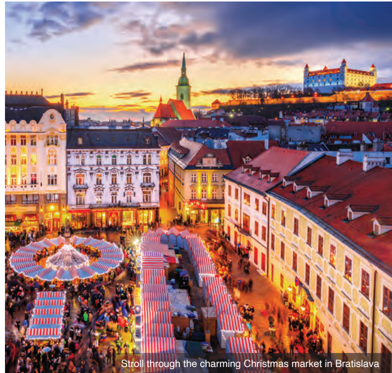
Stroll through the charming Christmas market in Bratislava

DAY 1 Depart the USA: Depart the USA on your overnight flight to Budapest, Hungary.