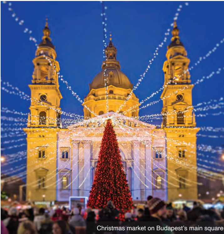
Christmas market on Budapest's main square