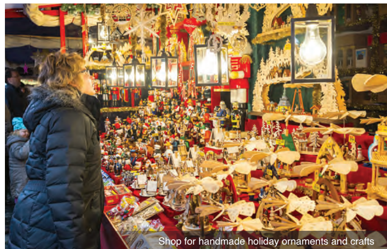
Shop for handmade holiday ornaments and crafts

Days 2 through 8 – Aboard an Emerald Cruises Star-Ship