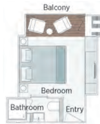
Panorama Balcony Suite