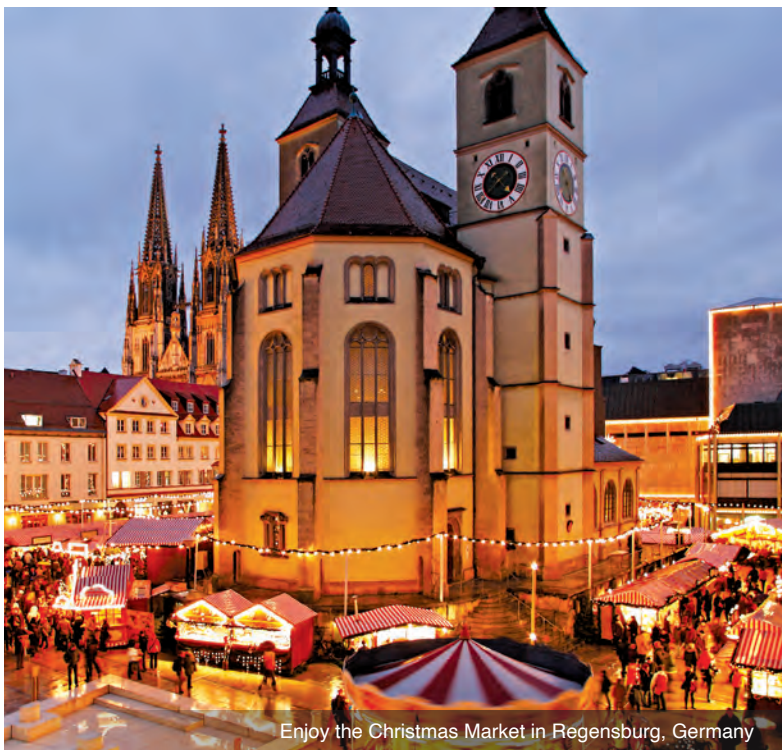
Enjoy the Christmas Market in Regensburg, Germany

homemade gingerbread! Enjoy the last day of your cruise in this historic city, decked out for the holidays. Meals: B, L, D