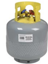
Refrigerant Recovery Tank Grey w/Yellow Top

Seating is limited. To Register FAX Application to 866-688-8655 OR email to CustomerTraining@HDSupply.com OR Register online at www.hdsupplysolutions.com/training . Phone 858-831-2465