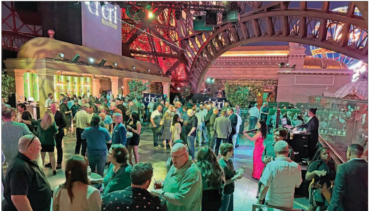
The Cheri Rooftop at the Paris resort on the Strip provided a beautiful outdoor venue and attracted a big crowd.