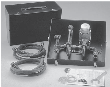
Field Meter Flow Test kits are available from a variety of manufactures and provide a means of spot- checking meter accuracy.

Field-testing of residential meters can be performed in-place to determine a general range of accuracy. When properly used the field unit can measure within 0.5% of accuracy. These types of test units are most valuable for spot-checking meter accuracy where a problem is suspected. They are also valuable in performing statistical analysis to determine the overall expected residential water meter efficiency in a water system. These devices are generally limited to flow ranges between 0.5 and 20 gpm.