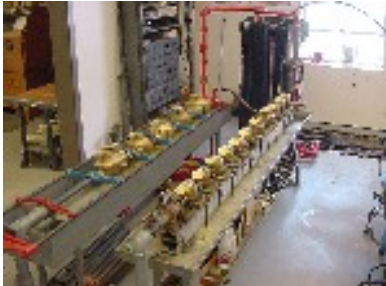
Residential Meter Test Bench used by Lakeland Utilities

neighboring utility system may allow you to use its equipment. Testing can be performing by the meter vendor, or by a private company specializing in meter testing. FRWA also has small meter testers from companies like Mars, etc that can be used, borrowed, or purchased by the utility.