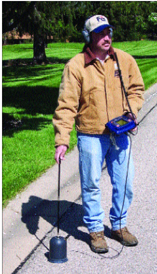
Water Leak Detector

The data suggests that there are a significant number of unaccounted for leaks in all systems and that many of the leaks are long-term and associated with water valves and fire hydrants. In areas where leaks are suspected they are found at much high frequencies.