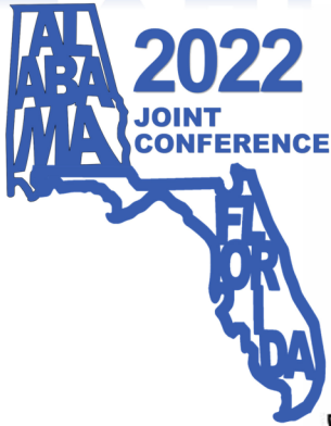
EXHIBIT HALL LAYOUT 2022 FL/AL JOINT CONFERENCE