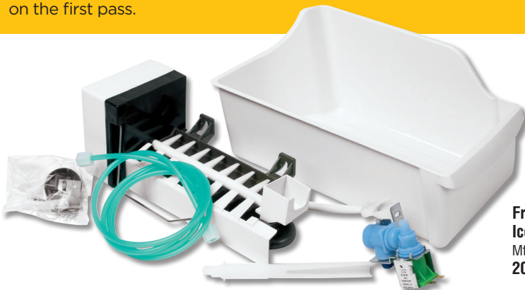
Frigidaire® Automatic Icemaker Kit Mfg #1M115 203301

A callback will be applied if any of the above requirements are not completed on the first pass.