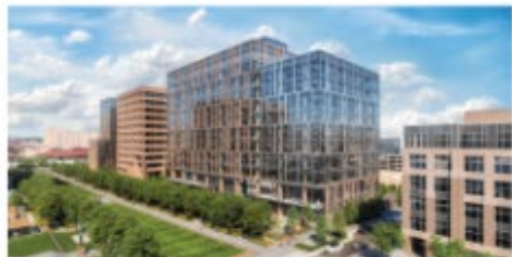
Barbara Jordan State Office Building (1601 Congress Ave.)