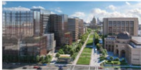
George H.W. Bush State Office Building (1801 Congress Ave.)