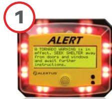
Up to 30 Alert Beacons® (1 per school)