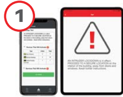
Mobile Apps (Activator & Recipient)