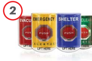
Up to 4 Activation Buttons (For district level)