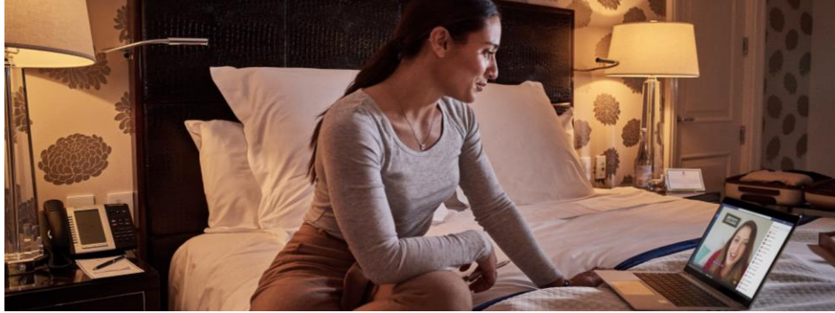
Teacher to Student Direct Calling via Teams App