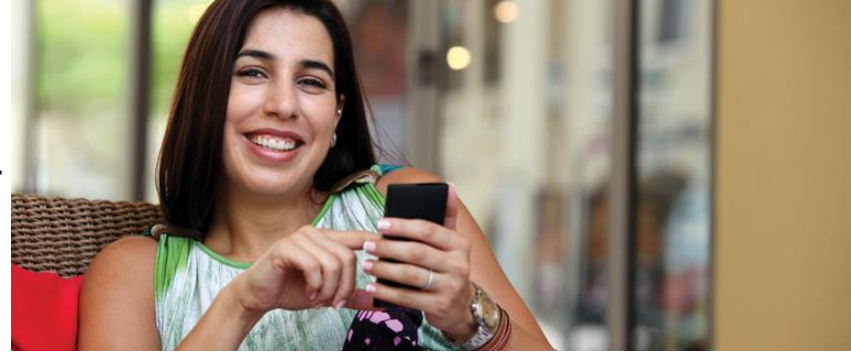
Join Teams Meeting & Content via App (iOS, Windows, Android)