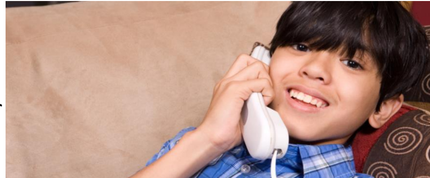
Only if no cell or wifi, require land line dial in (requires additional licensing)