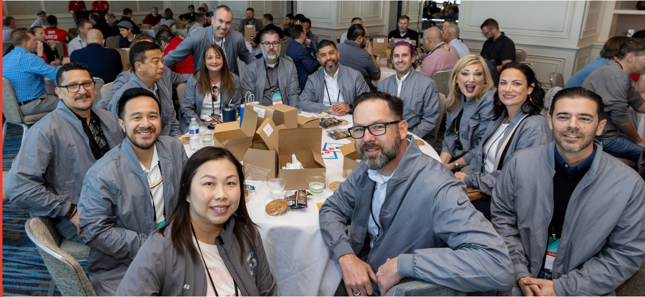
CTOM Cohort 18 - CITE Conference 2024