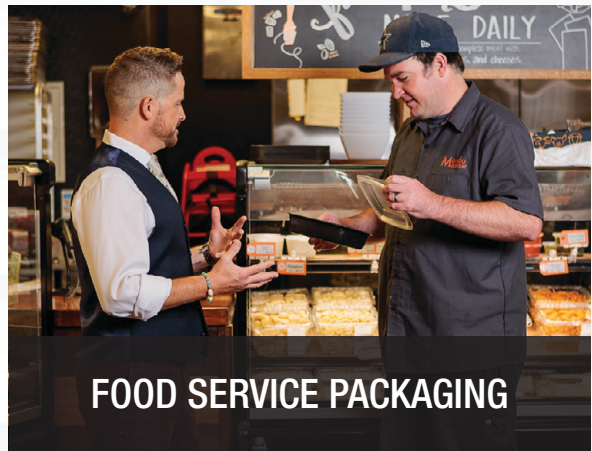
FOOD SERVICE PACKAGING