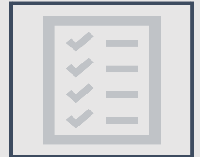
POLICIES AND BYLAWS