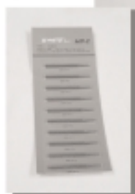
SS White Burs