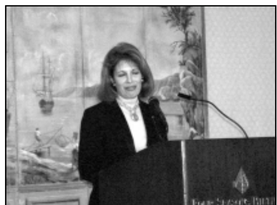
State Senator Jackie Speier presented her views on the safety record of Oral Surgeons, the State Budget, and other issues that affect the ability of professionals to work with the state legislature.