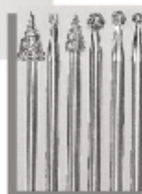
Diamond Osteotomy Burs