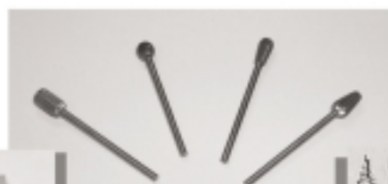
Bone Trimming Burs

Xemax has a wide variety of innovative and time-saving products, as well as excellent prices on your favorite burs, membranes and other essential items!