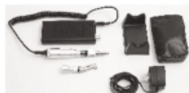
Rechargeable Slowspeed Handpiece

Xemax has a wide variety of innovative and time-saving products, as well as excellent prices on your favorite burs, membranes and other essential items!