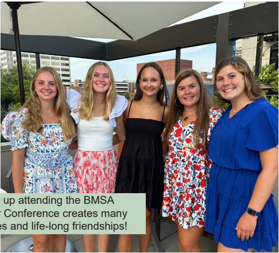
Growing up attending the BMSA Summer Conference creates many memories and life-long friendships!