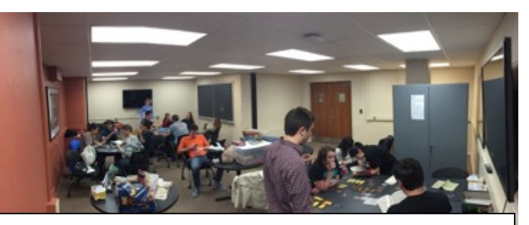
Several CBS members gather in a study room in Rhodes Engineering Research Center to play games.

During the spring semester of 2016 the social committee promoted game nights in the department, in which students were encouraged to bring board and card games, as well as snacks, to contribute to a relaxing time among friends and colleagues.