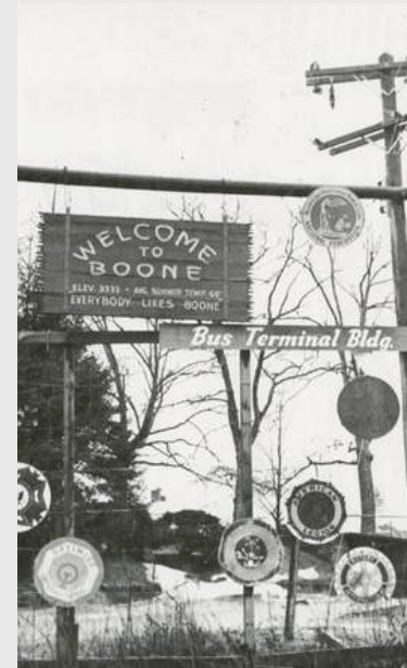
Welcome to Boone sign, 1960's.