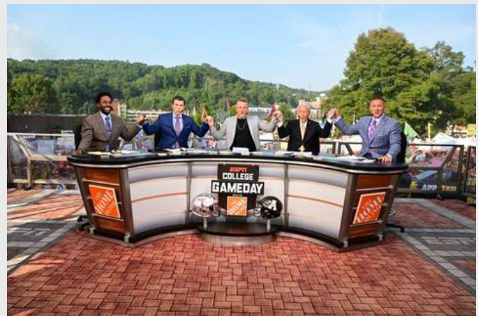
ESPN's College GameDay in Boone for the first time, September 17, 2022.