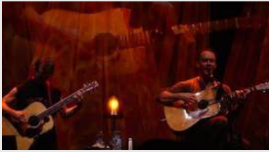
Dave Matthews & Tim Reynolds in the Holmes Center, March 2003