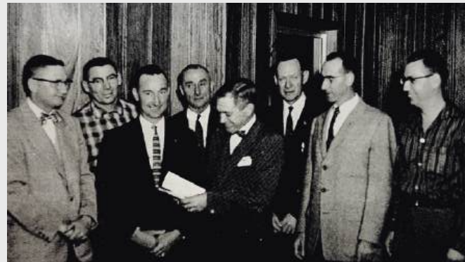
Business leaders purchase land for the new golf course in the 1950's.