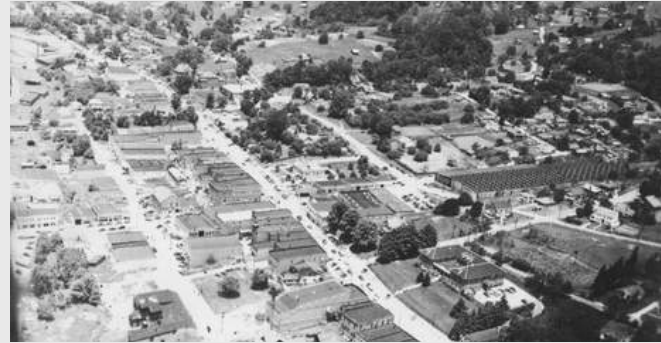
Aerial of Boone, 1950-60's.