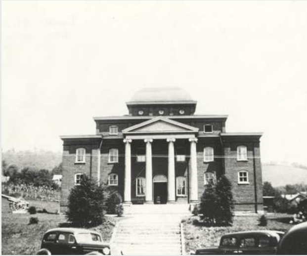
Watauga County Courthouse, 1930's.