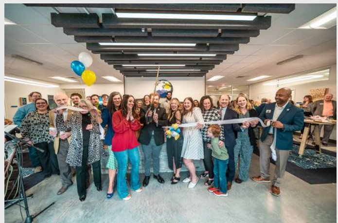
Boone Chamber Ribbon cutting for new office space on Greenway Road, opened January 2023.