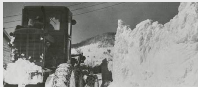
Winter storm brings 100 inches of snow, 1960.