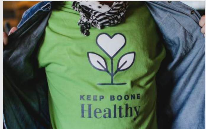
#KeepBooneHealthy T-shirt with proceeds supporting local businesses during the pandemic, March 2020.

April 13, 2024 – Watauga County Childcare Study is released, informing advocacy and action plans for community partners including the Chamber, Watauga EDC, and the Children's Council of Watauga County.