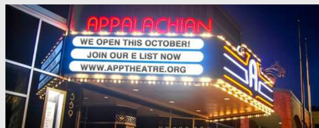
Appalachian Theatre's renovated marquee announcing reopening in October 2019.

October 14, 2019 – Appalachian Theatre of the High Country reopens its doors to the community after a long fundraising and renovation project.