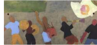
Brandon Juan Surtain