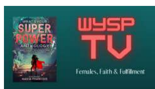
What's Your Super Power Anthology