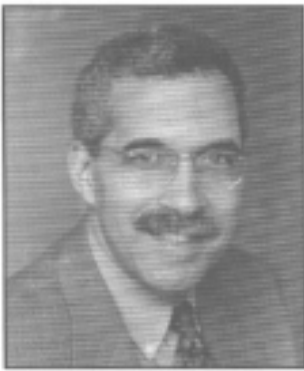
Claude M. Steele