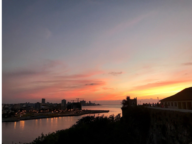
View from the ramparts