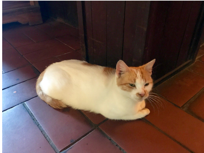
Gato de ajibe

A open-air palapa style family style restaurant specializing in roast chicken (for those that eat it), as well as the ubiquitous rice-and-beans, plantain chips, and assorted vegetables. Cats roamed the restaurant for handouts. A talented quartet played a selection of traditional Cuban music. The restaurant's name refers to the typical home water cisterns. This is a state run restaurant .