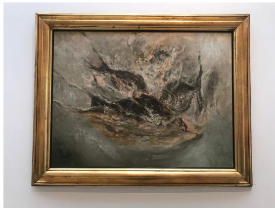
Peces, 1941 Fidelio Ponce De leon (1895-1949)