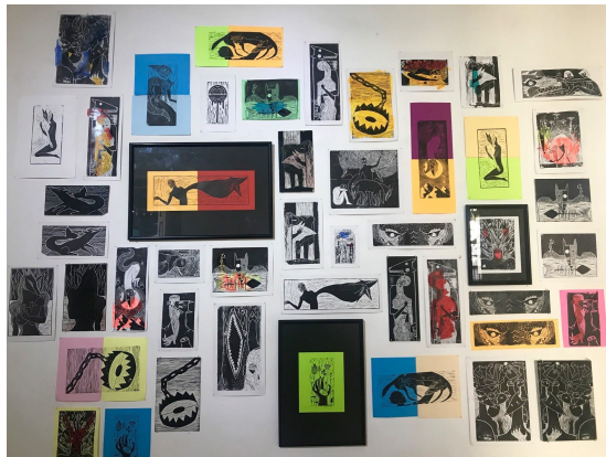
Lino Print exhibition