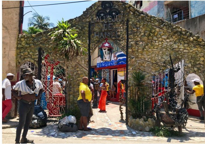
Callejon de Hamel entrance

Also known as Hamel Alley , this street is an open-air Afro-Cuban sanctuary. The colorful 200 foot mural that stretches along the street is the work of Cuban painter Salvador González Escalona. In addition to visiting various artists shops, we briefly observed a rumba show, which happens every Sunday and is attended by locals and tourists alike.