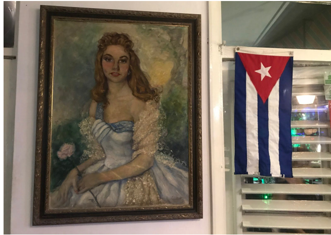
Portrait of owner's mother in honor of her quinceanera

Our penultimate meal was shared at La Casa , a restaurant in the Vedado neighborhood. La Casa is one of Havana's oldest private restaurants (paladares) and was opened shortly after private businesses were legally allowed to operate in the 1990s. Originally a private home, it's now home to only the owner's father. Entrees included the usual fare as well as conejo (rabbit) and cabra (goat, often misidentified in English as 'lamb'). We enjoyed live music by a trio of musicians playing for us in the dining room.