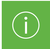
Signage to Consider

We need your feedback! Please email your comments to info@bomacanada.ca and help us keep this document current. We already have dozens of coronavirus-related resources for you at www.bomacanada.ca/coronavirus and will post updated versions of this document there too.