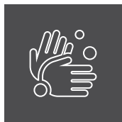
Hand Sanitization Stations