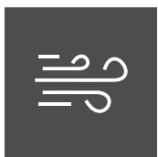
Ventilation & Filters