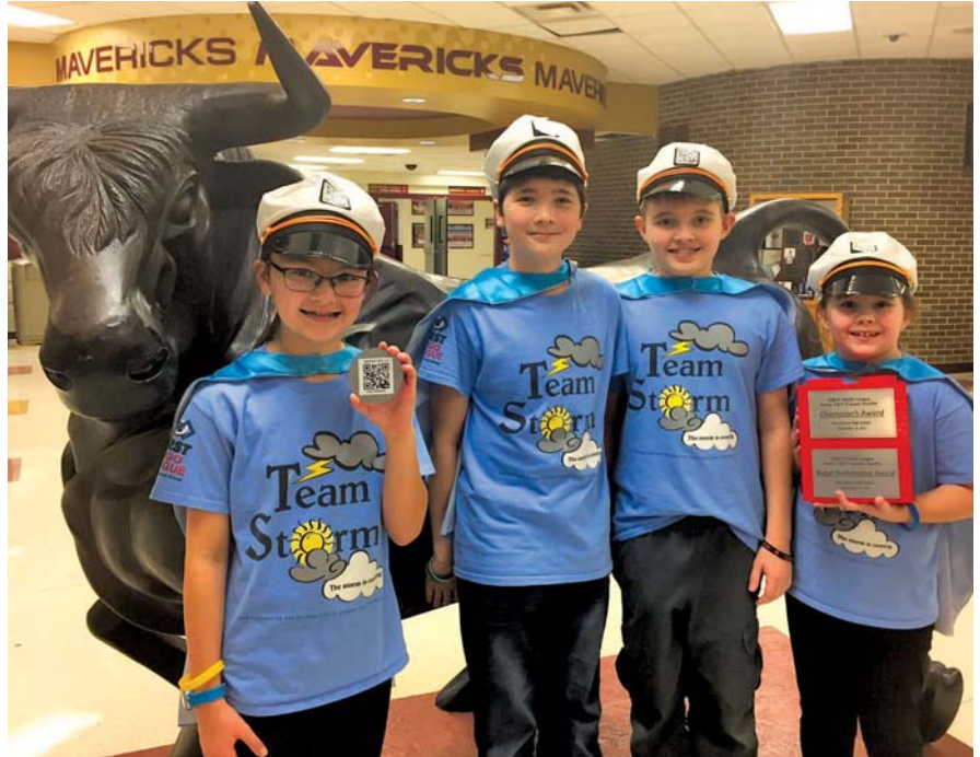
And the winners are... Team Storm!

Our solution will improve the way we dispose of stormwater runoff because problems can be reported quickly and addressed immediately. All you have to do is scan the QR code easily visible on a storm drain and you will be taken right to the website where you can instantly upload your photo, and you're done! (The code in the photo actually works and will take