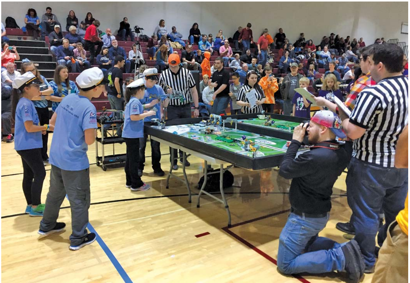
Team Storm competing.