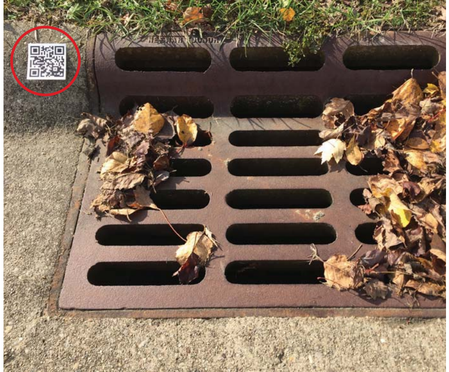
QR Code attached to a storm drain.