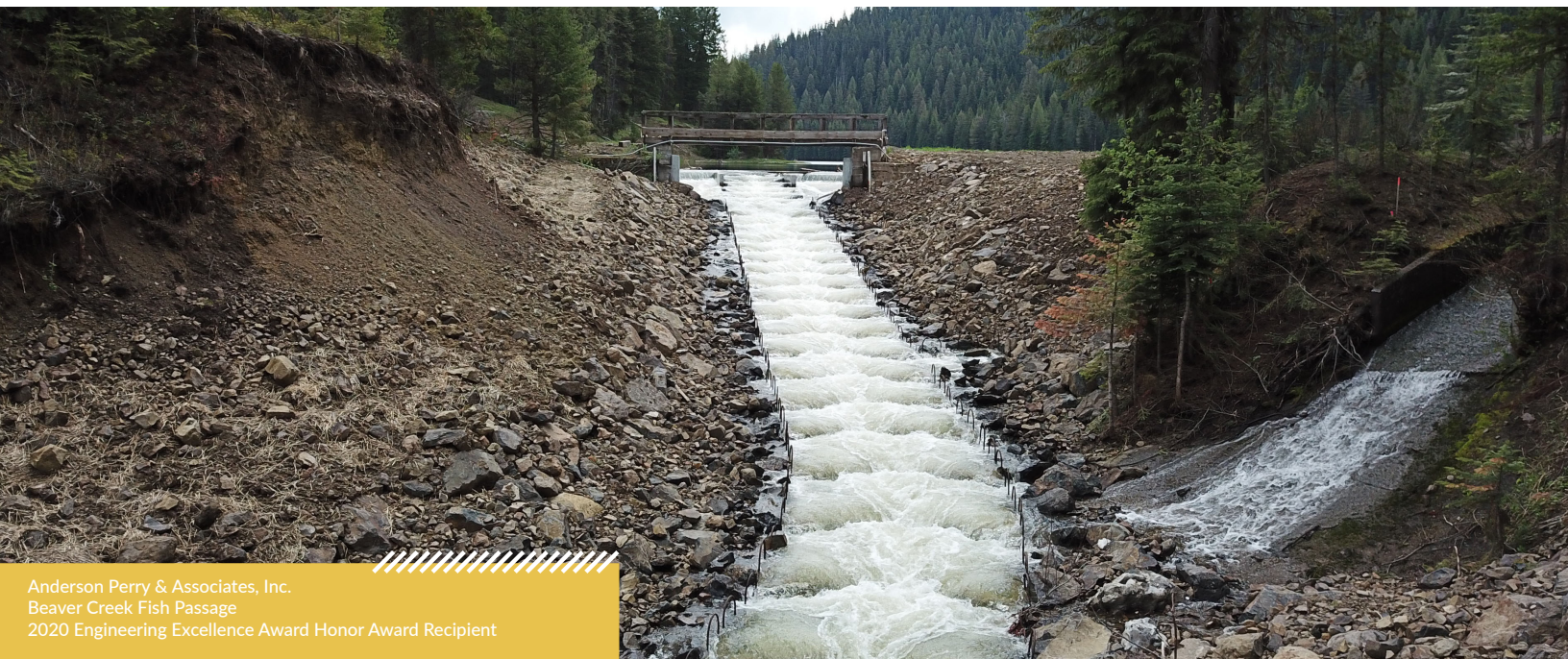
Anderson Perry & Associates, Inc. Beaver Creek Fish Passage 2020 Engineering Excellence Award Honor Award Recipient