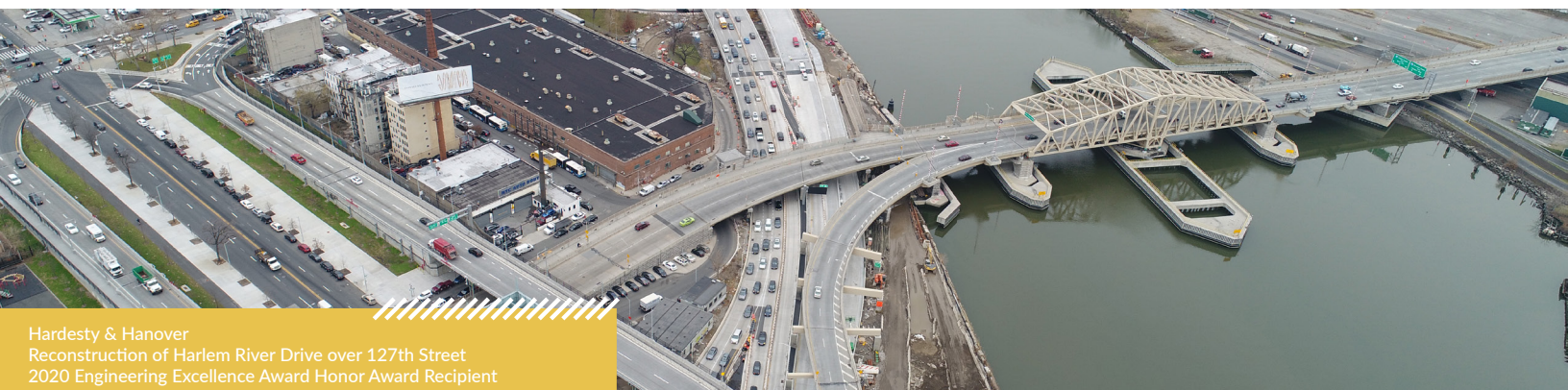
Hardesty & Hanover Reconstruction of Harlem River Drive over 127th Street 2020 Engineering Excellence Award Honor Award Recipient