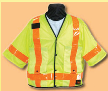
Example of Performance Class 3 Apparel