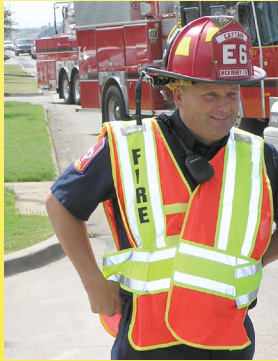
Example of Public Safety Apparel

This is apparel that can be utilized by fire service, emergency medical service (EMS), and law enforcement personnel in response to situations near and on the roadway. These types of apparel provide the user with features including access to belt-mounted equipment and/or tear away shoulders to allow the vest to tear away from the body if the wearer is stuck. ANSI/ISEA 207-2006, “American National Standard for High-Visibility Public Safety Vests,” covers apparel standards for public safety personnel working in the roadway—like fire service, EMS, and law enforcement personnel. Public safety