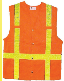
Washington DOT Performance Class 2 Apparel