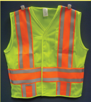
Michigan DOT Performance Class 2 Apparel