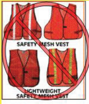
Unacceptable Apparel Examples