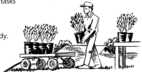
Always use the correct posture when carrying objects.