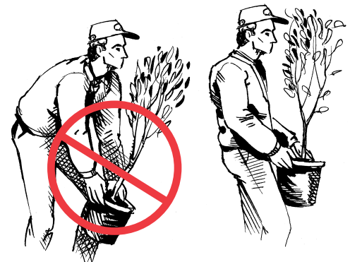
Don't bend from the waist when picking up an object.