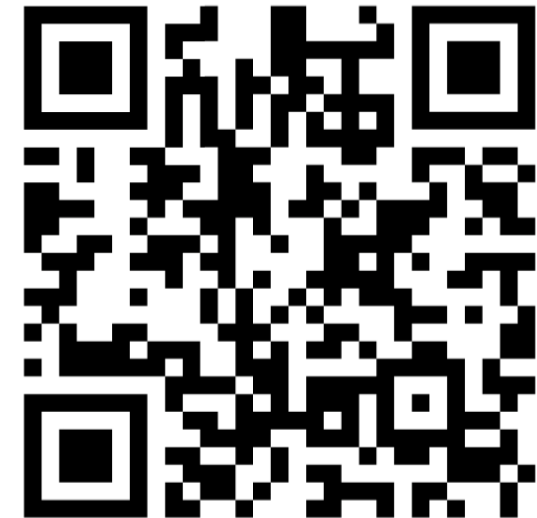
QBS Resource Portal