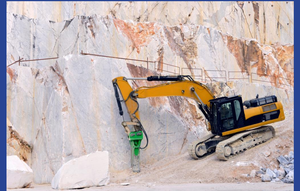
GEOPROFESSIONALS GEO Coalition

The Design Professional Coalition is managed separately.