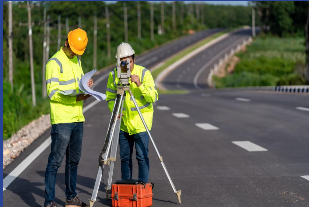
PROFESSIONAL SURVEYORS COPS Coalition