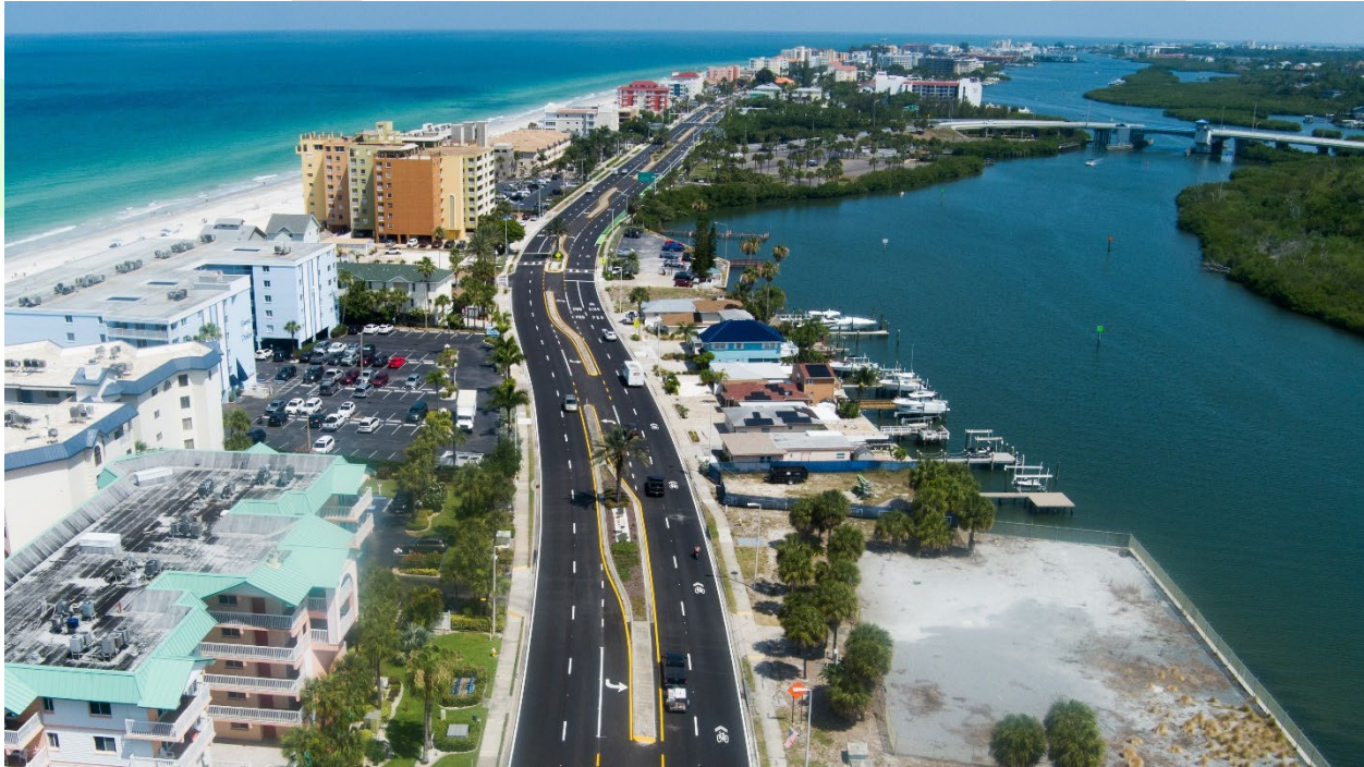
State Road 699 (Gulf Blvd) From N of 183rd Terrace W to N of 192nd Ave