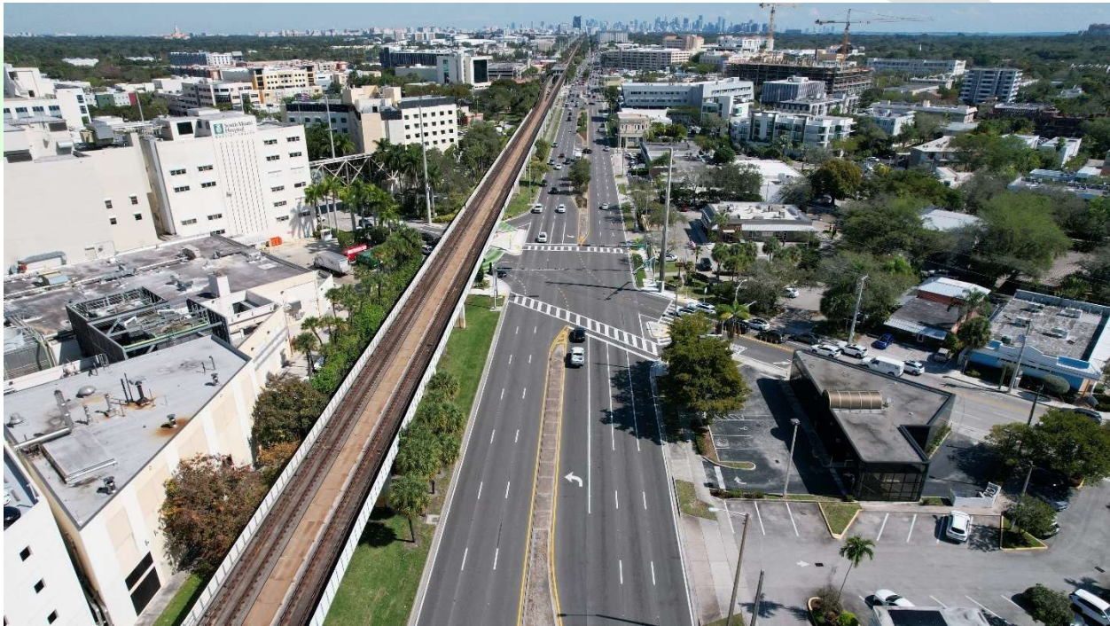
SR 5 (US 1/S Dixie Hwy.) From North of SW 80 St. to South of Riviera Dr.