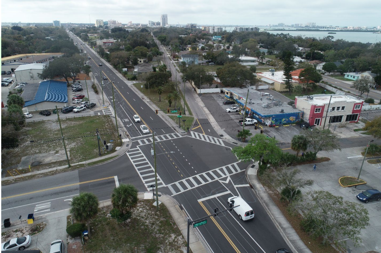
CFX SR 417 from SR 50 to Aloma Ave