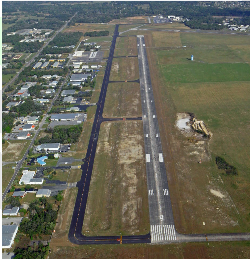
Taxiway A Brooksville Tampa Bay Regional Airport