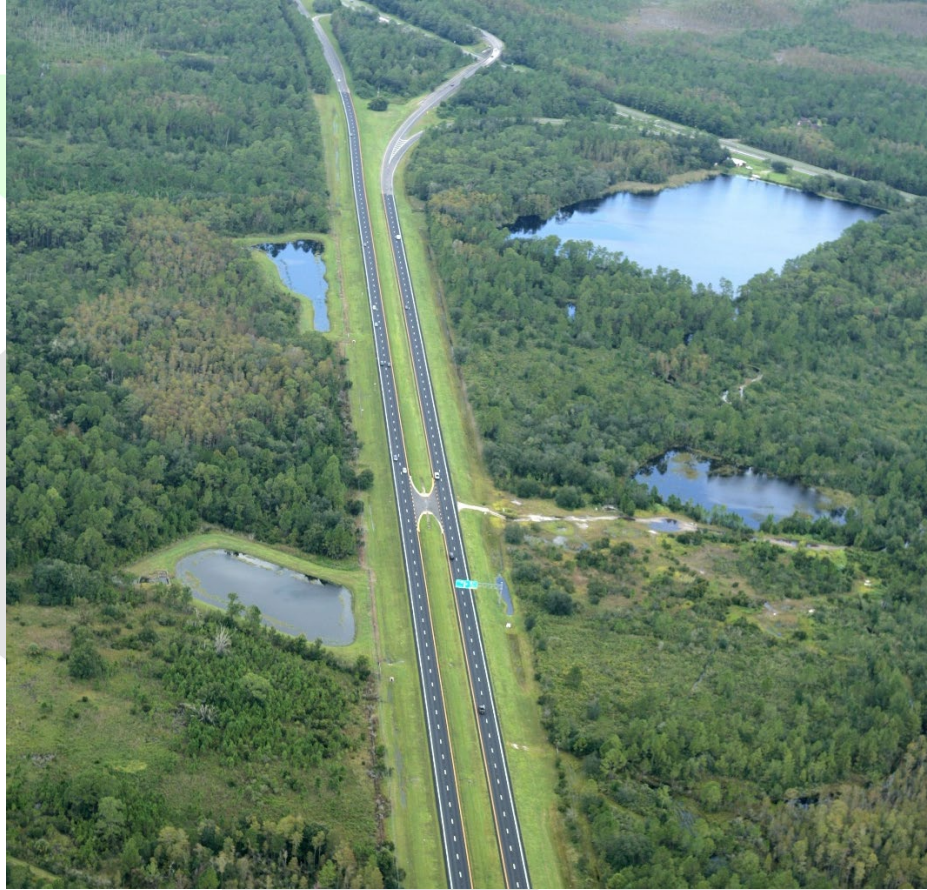
SR 520 from East of SR 50 ramps to West of SR 528