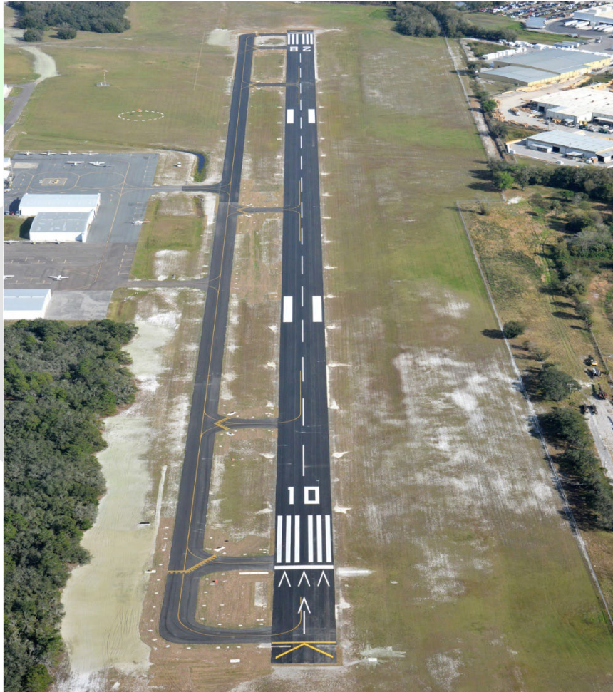
Runway 10-28 Pavement Rehabilitation – Tampa International Airport