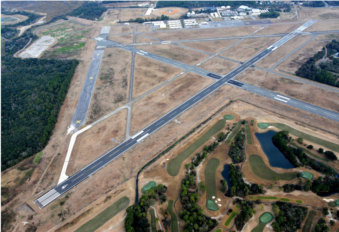
Amelia Island Pkwy, Runway 4-22 Rehabilitation, Fernandina Beach Municipal Airport