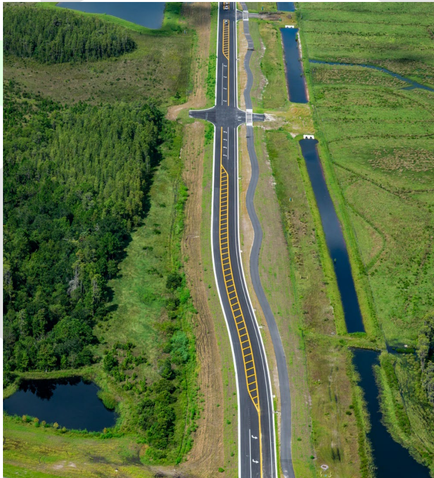
Tower Rd & Sunlake Blvd-Bexley Tower Road extension of Ballantrae Blvd to Sunlake Blvd.