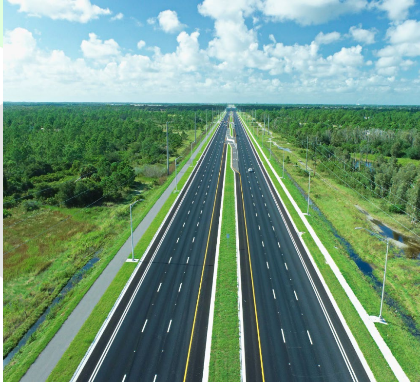
SR 82 from Shawnee Rd. to Alabama Road